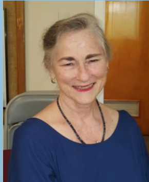
Spiritual Growth Coordinator

I encourage every local UMW members to attend District and Conference events. All dates will be posted on our website and will be included in each issue of "The Messenger's Flame" .