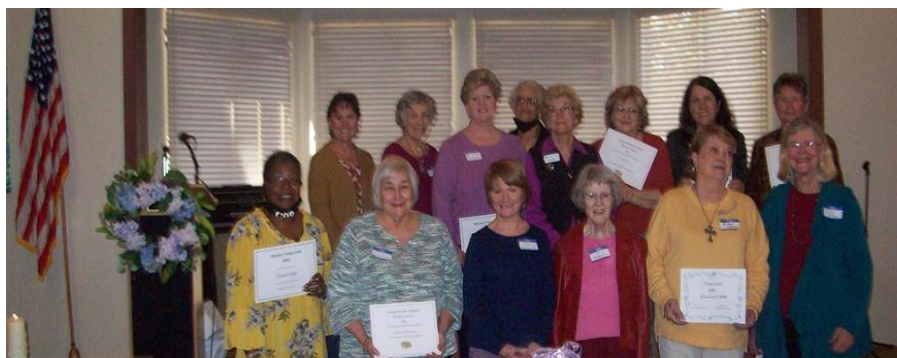
Local units who received certificates for the Reading program, Mission Today, 5 Star, Charter for Racial Justice