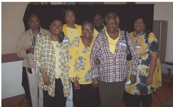
Chapel local unit with the most women in attendance