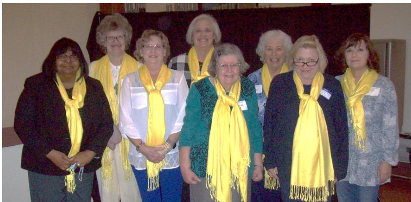
Dalriada Local unit hosted Annual Day